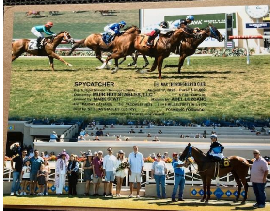
Founding Forward Race Winner's Circle