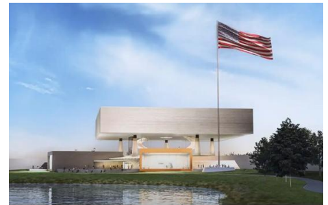
National Medal of Honor Museum